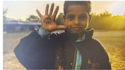
Street Art for Mankind