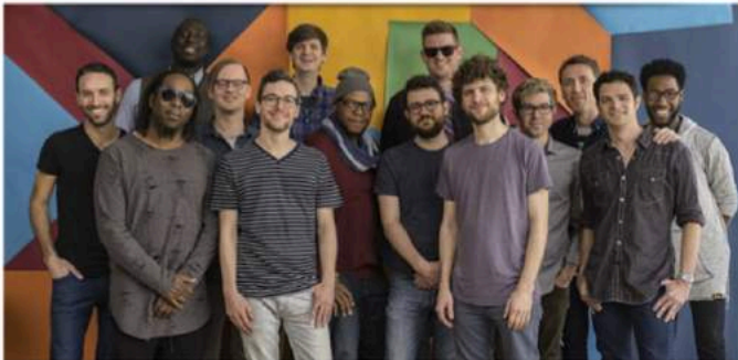
Friday: Snarky Puppy at GroundUp Music Festival.

WEDNESDAY, FEBRUARY 8, 2017 AT 8:05 A.M.